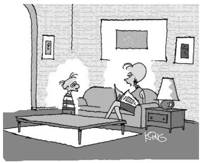
"No, you weren't downloaded. Your were born."

Figure and table captions should be centered if less than one line (Figure 1), otherwise justified and indented by 0.8cm on both margins, as shown in Figure 2. The caption font must be Helvetica, 10 point, boldface, with 6 points of space before and after each caption.